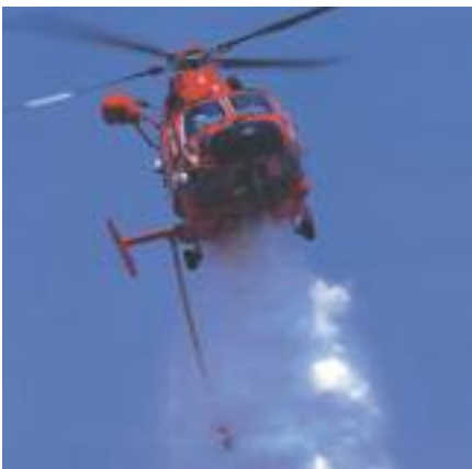
AS365 N3+ – cargo hook capacity: 1,600 kg / 3,527 lb