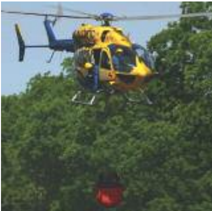
EC145 – cargo hook capacity: 1,500 kg / 3,307lb