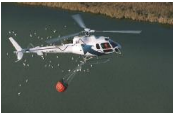
Firefighting using a Bambi Bucket