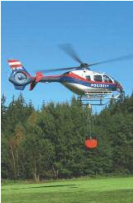
EC135 T3/P3 – cargo hook capacity: 1,300 kg / 2,866 lb