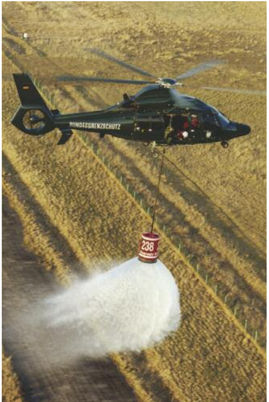
EC155 B1 – cargo hook capacity: 1,600 kg / 3,527 lb