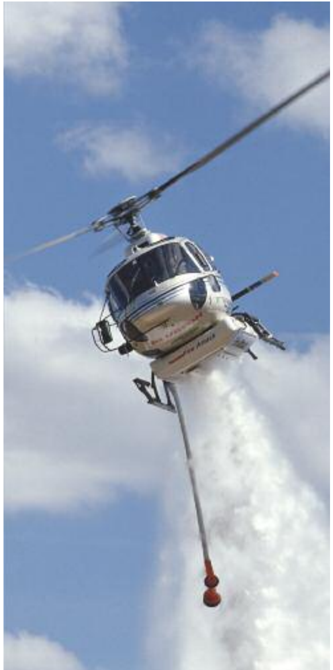
Firefighting using a Belly Tank